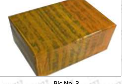
Pic No. 3 International express packaging: Wrapped with yellow tape after wrapping black protective film